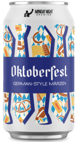
Monday Night Brewing West Midtown, GA Birmingham, AL & Nashville, TN Oktoberfest 5% ABV

Grab a pint of seasonal beer from some of our favorite breweries in and around Atlanta.