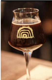
SCEPTRE Brewing Arts Oakhurst, GA Patch Jacket Pumpkin Beer 7% ABV