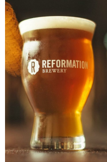
Reformation Brewery Woodstock, Canton & Smyrna, GA Reformation Oktoberfest Märzen 5.5% ABV