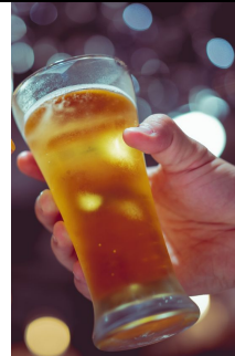
Eventide Brewing Grant Park, GA Amarizzle Drizzle Wet Hopped IPA 6.3% ABV