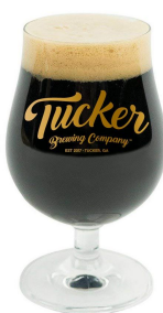
Tucker Brewing Company Tucker, GA Barrel-Aged Sir Doppelbock 11% ABV