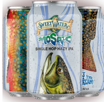
Sweetwater Brewing Atlanta, GA Mosaic Single Hop Hazy IPA 6.2% ABV