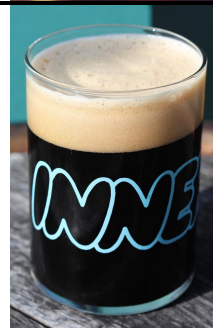
Inner Voice Brewing Decatur, GA Eurostop Baltic Porter 7% ABV