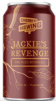
Cherry Street Brewing Alpharetta & Cumming, GA & Chattanooga, TN Jackie's Revenge Oak Aged Brown Ale 7% ABV